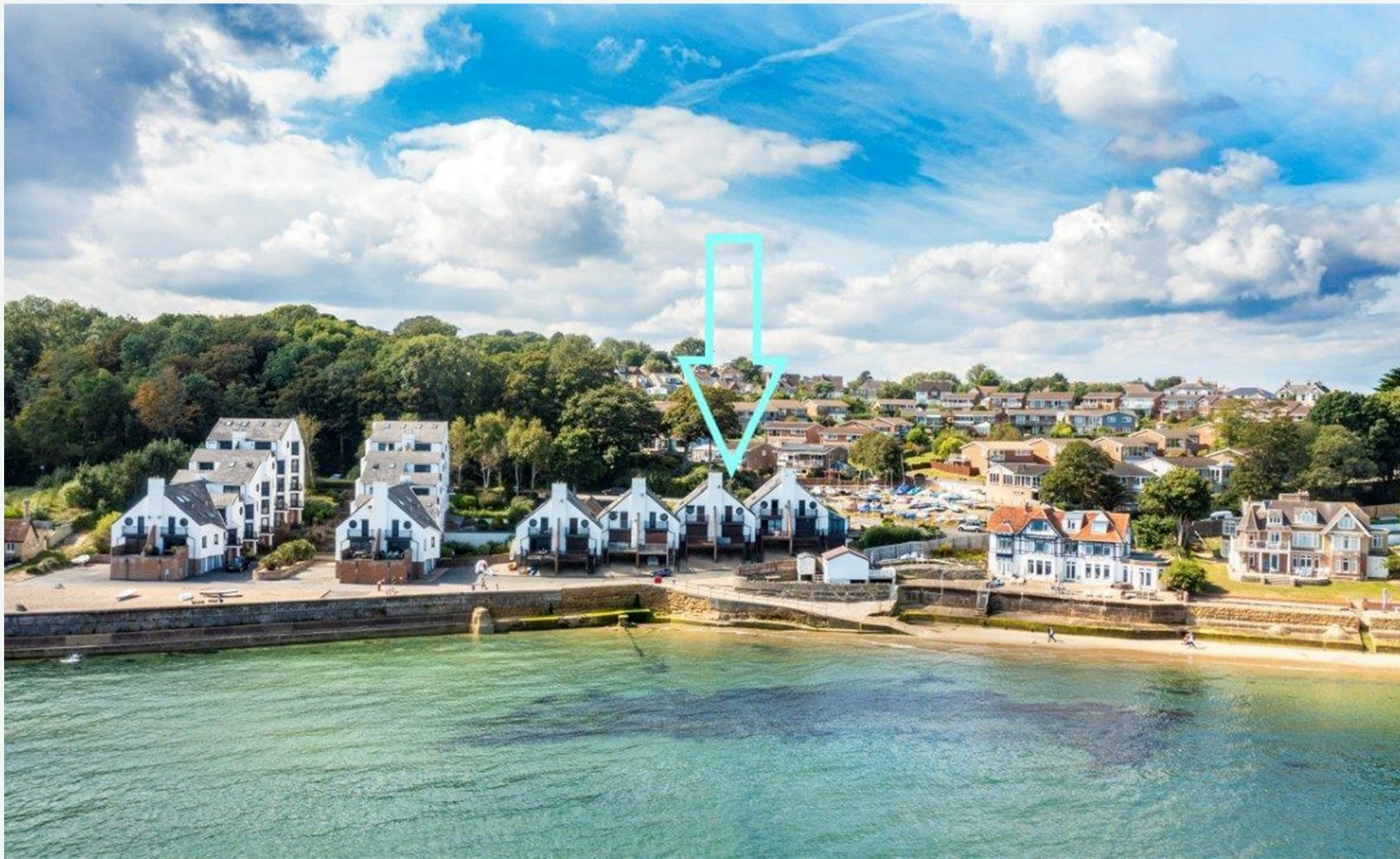
3 Seaview Bay, Pier Road, Seaview, Isle of Wight, PO34 5BP